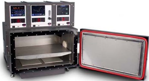
avionics systems production