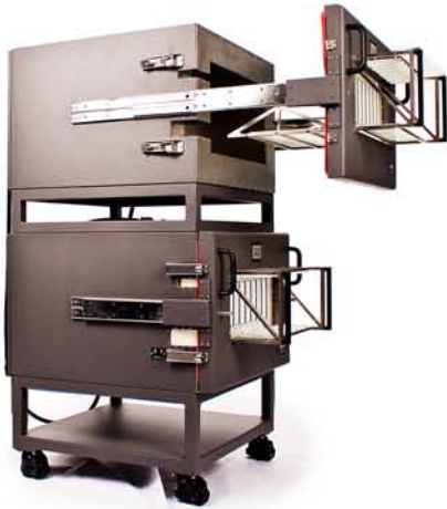
PCB batch production