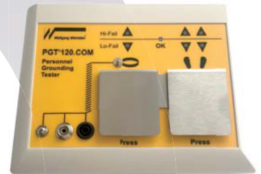
PGT120.com Made in German