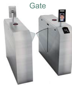
Support all kinds of gate

Hikvision face recognition equipment is adopted