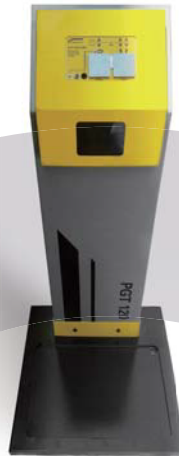
The test platform