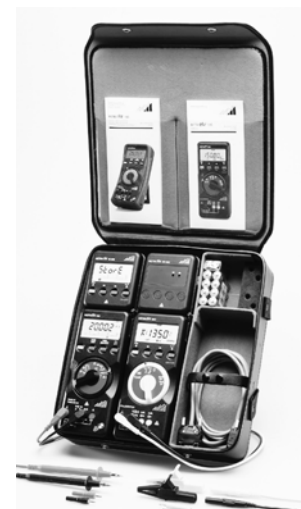
F840 (with sample contents)